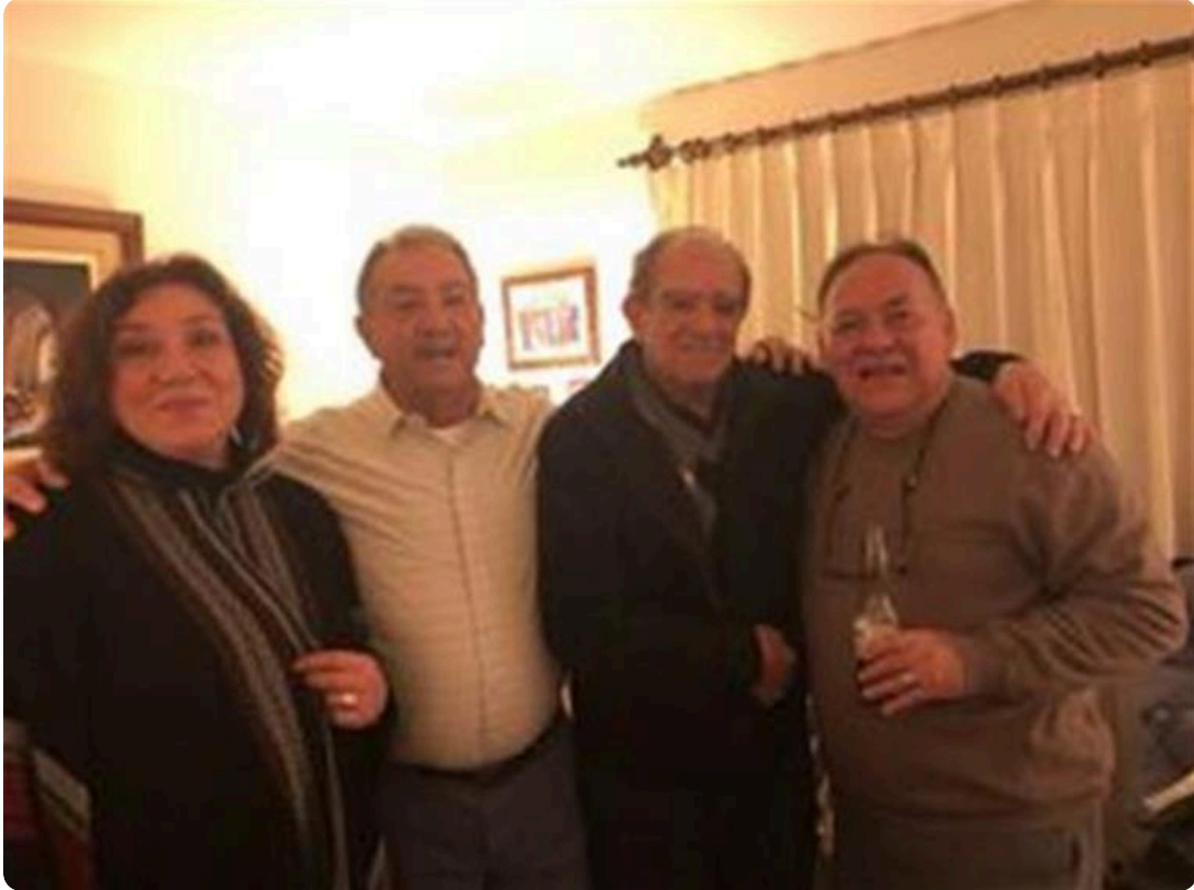
Siempre en nuestros corazones.